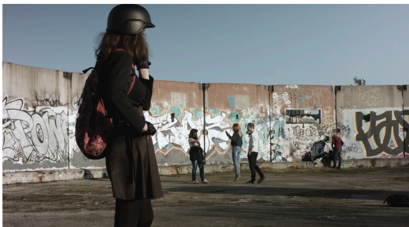
Audiovisual live-documentary performance The Informals, Sonic Acts Festival Amsterdam 2019, Inversia Festival Murmansk 2019, in collaboration with Andreas Kühne